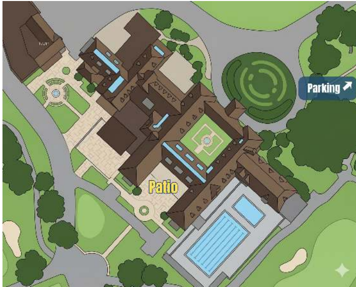
The historic clubhouse, with the pool to the south.

Detroit Golf Club is at 17911 Hamilton Road, Detroit, MI 48203 . Pull through the main gate and follow the drive to the clubhouse circle. The most convenient parking is in the lot directly east of the clubhouse, with overflow available east of the cart barn / bag room . Swimmers can be dropped at the roundabout — a welcome sign by the sidewalk points them to the entrance door just south of the main entrance , where they can walk straight back to the pool area.